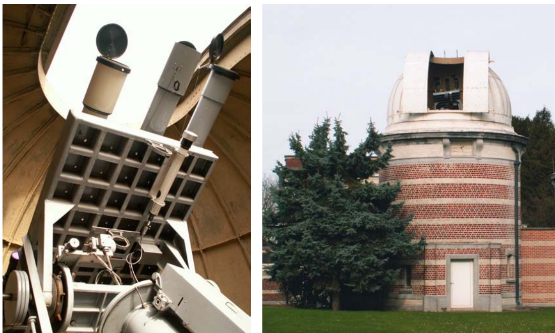
Figure 2: The Uccle Solar Equatorial Table with its 3 solar patrol telescopes and an outside view of the solar dome.

The instruments remained largely unchanged over the 2004-2006 period. However, considering the aging of various pieces of equipment, a project was developed in 2006 to seek funding for a modernization of the USET. A funding was finally obtained for 2007 (Belgian National Lottery funding to science research). It will allow upgrading the CCD cameras (2048x2048 pix) and the H- \alpha monochromator (replacement of vintage Lyot filter). It will also allow adding a new channel in the Ca-II-K line for synoptic calibrated observations. This CaII-K telescope will be developed in collaboration with the Observatory of Rome (PSPT/RISE consortium).