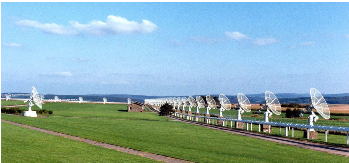
Figure 3: Panoramic view of the Humain radioastronomy station showing the 48 4m antenna array of the 408MHz radioheliograph (no more in operation) as well as one of the auxiliary 6m parabolas (left side of the image). Most of these parabolas are in working order and can be refurbished with new state-of-the-art receivers.

Other international collaborations have been initiated around the Humain modernization with the Observatory of Trieste and the Dominion Radioastronomy Observatory (Penticton, Ottawa).